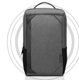
Lenovo 15.6" Laptop Urban Backpack B530