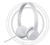
Lenovo 110 USB Stereo Headset