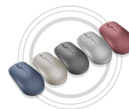
Lenovo 530 Wireless Mouse